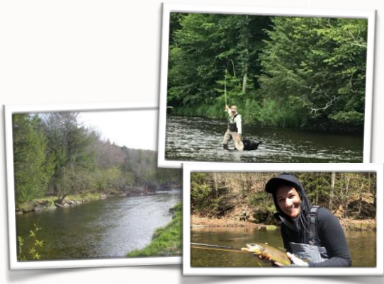
Prime Catskills fly fishing without the crowds

People often speak of the “zen-like” aspects of fly fishing. Fly fishing anglers will tell you there is no activity better to relax and unwind than casting to a rising trout. Now imagine being able to enjoy your favorite activity without the worry of a dozen other anglers camped in your favorite fishing spot.