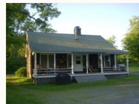
The Debruce Fly Fishing Club clubhouse

A fully furnished and heated clubhouse is available for use by the members. The clubhouse has four bedrooms with single beds, a well equipped kitchen, a full bathroom, and wifi to stay connected. The living room features a large stone fireplace where members can relax by the fire and swap fish stories. We even have a fully stocked fly tying desk so you can test your skills at matching the hatch!