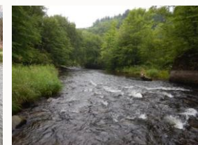
One of the many riffles